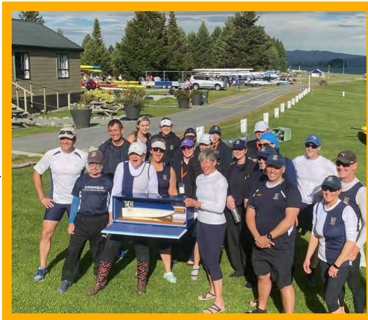
Our Ruataniwha Masters squad – trophy winners for the most club wins and placings